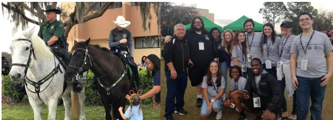
Sheriff's Department at Light Up The Night